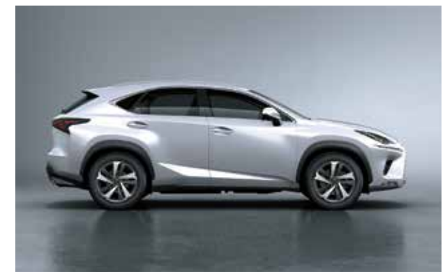
SONIC QUARTZ (085)