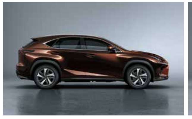
AMBER CRYSTAL SHINE (4X2)