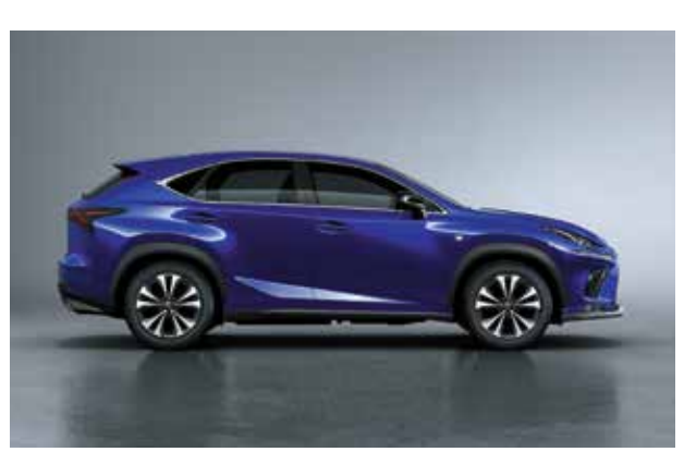
HEAT BLUE (8X1) (Exclusive for NX F-Sport)