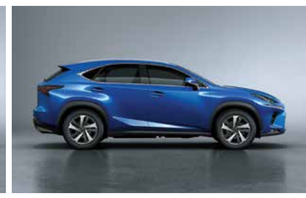
SPARKLING METEOR METALLIC (8X9)