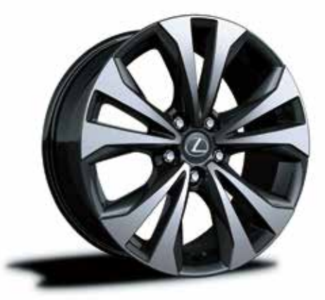
18-INCH ALUMINIUM WHEEL (NX 300 F-SPORT)

A bright machined finished and a dark metallic coating realizing a dynamic two-tone graphic with a three-dimensional depth that enhances the dynamic impression