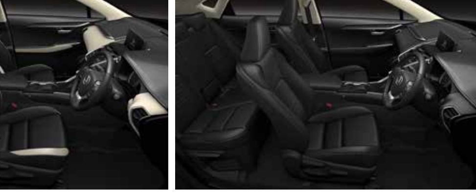
BLACK (Exclusive for NX 300 Luxury)