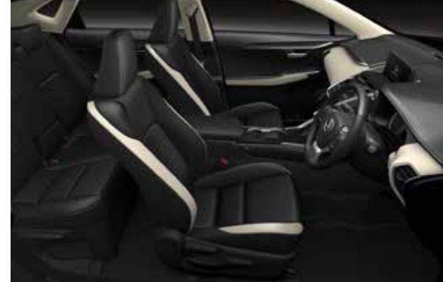
ACCENT WHITE (Exclusive for NX 300 Luxury)