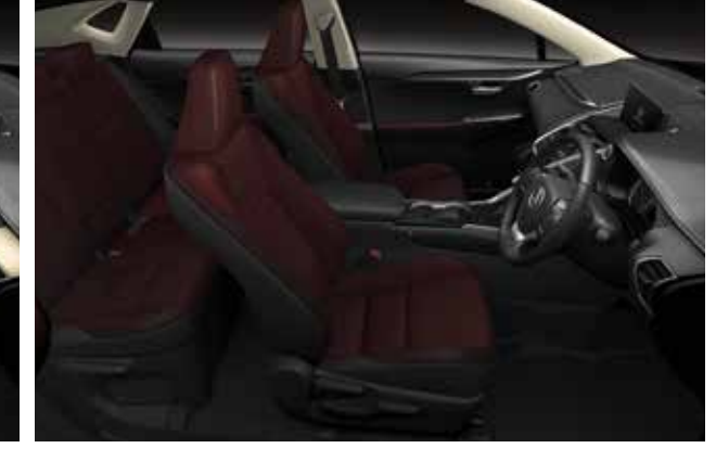
DARK ROSE (Exclusive for NX 300 Luxury)