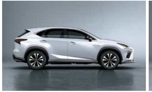
WHITE NOVA GLASS FLAKE (083) (Exclusive for NX F-Sport)