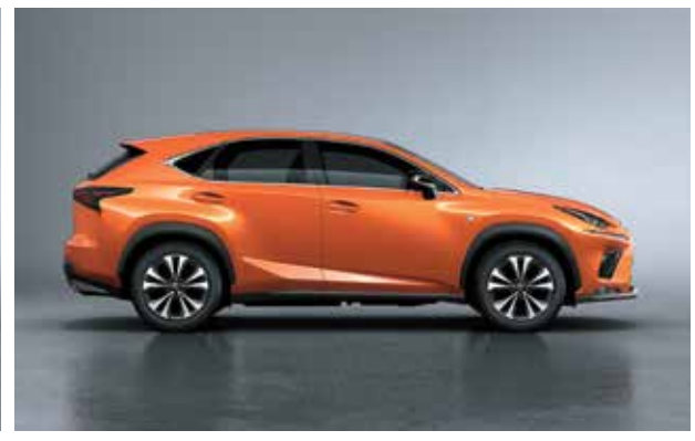
LAVA ORANGE CRYSTAL SHINE (4W7) (Exclusive for NX F-Sport)