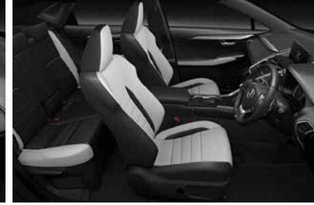
WHITE (Exclusive for NX F-Sport)