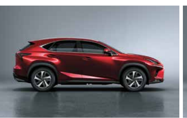
2) RED MICA CRYSTAL SHINE (3R1)