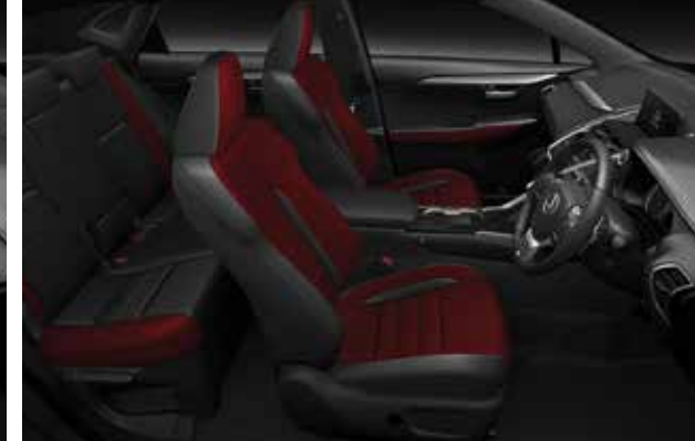
FLARE RED (Exclusive for NX F-Sport)