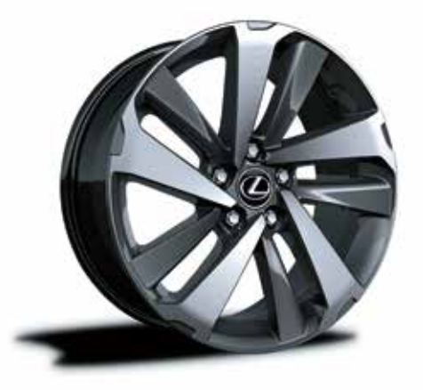
18-INCH ALUMINIUM WHEEL (NX 300 Luxury)

A bright machined finished and a dark metallic coating realizing a dynamic two-tone graphic with a three-dimensional depth that enhances the dynamic impression