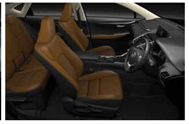
OCHRE (Exclusive for NX 300 Luxury)