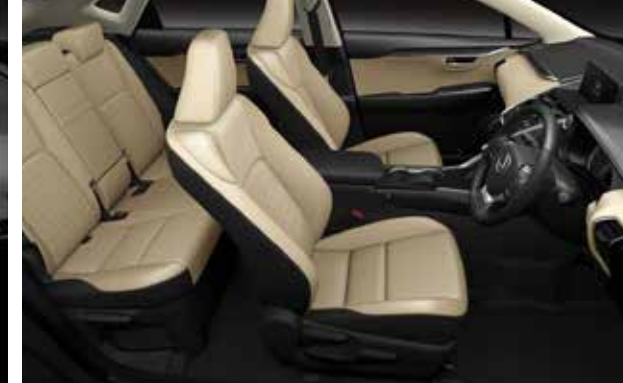
WHITE OCHRE (Exclusive for NX 300 Luxury)