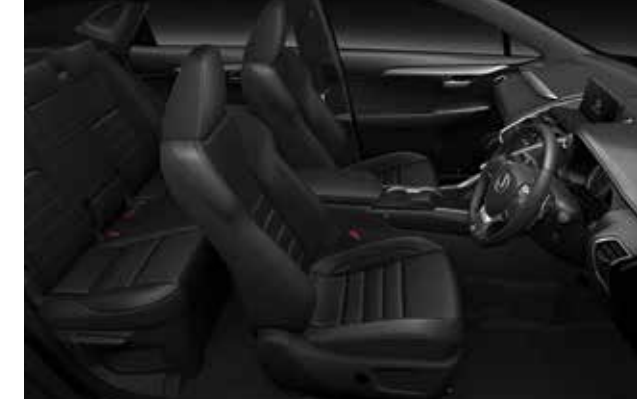
BLACK (Exclusive for NX F-Sport)