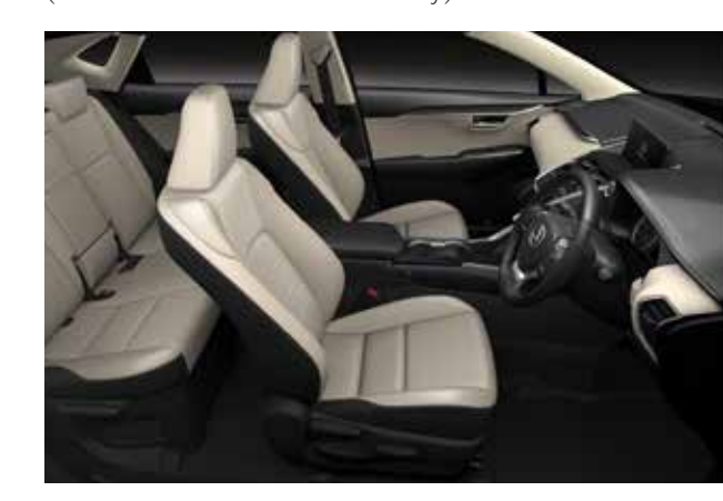
RICH CREAM (Exclusive for NX 300 Luxury)